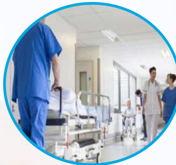
Scope to Explore and search the Hospitals and Doctors