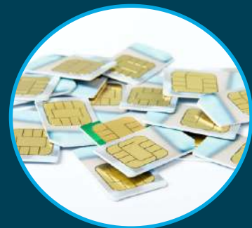
Local Phone line