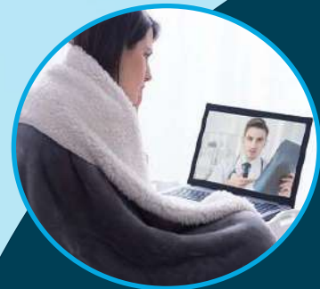
Pre Visit Online consultation