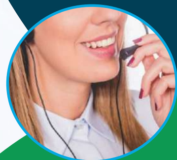
Follow up call on regular basis.