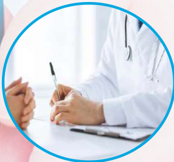
Fair Medical opinion