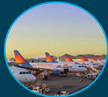
Airport Pick up/ Drop