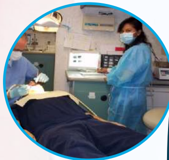
On Ground Support